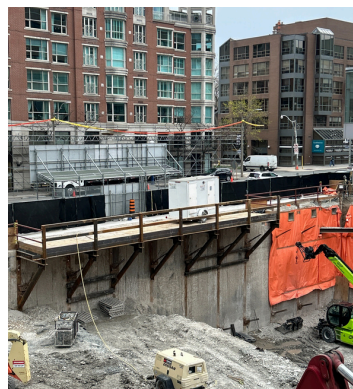
(Figure 3): Progress of platform installation on west side of site.