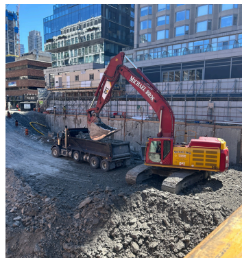
(Figure 2): Bulk excavation activity, view of south side of site.